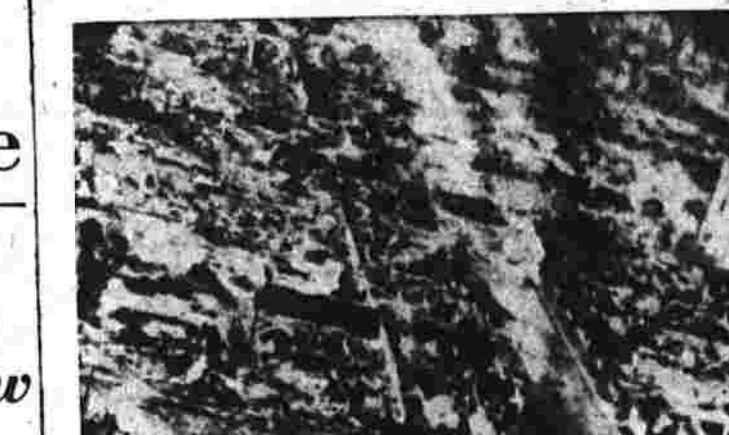
Widespread devastation marks the path of Japanese retreat through Manila's residential area where they burned or blasted wide sections of the city. At right upper center in Masonic temple and at right is one wing and swimming pool of the Philippine Women's university. Both buildings are the heaviest fire of the bitter campaign.

Heavy Fighting Ahead An American force from its main air field for the first time, the top Marine commander today, locally cheering Filipinos as they fought their way through the central plateau during a 400-yard advance through probably the heaviest fire of the bitter campaign.