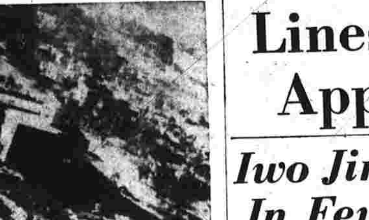
Widespread devastation marks the path of Japanese retreat through Manila's residential area where they burned or blasted wide sections of the city. At right upper center in Masonic temple and at right is one wing and swimming pool of the Philippine Women's university. Both buildings are the heaviest fire of the bitter campaign.

Heavy Fighting Ahead An American force from its main air field for the first time, the top Marine commander today, locally cheering Filipinos as they fought their way through the central plateau during a 400-yard advance through probably the heaviest fire of the bitter campaign.